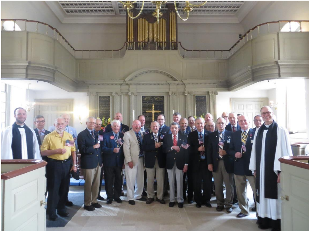
Above: members of the Williamsburg Chapter SAR stand inside Bruton Parish Church. The Williamsburg Chapter sponsors a Service of Prayer and Thanksgiving each year on the 4 th of July at the church.