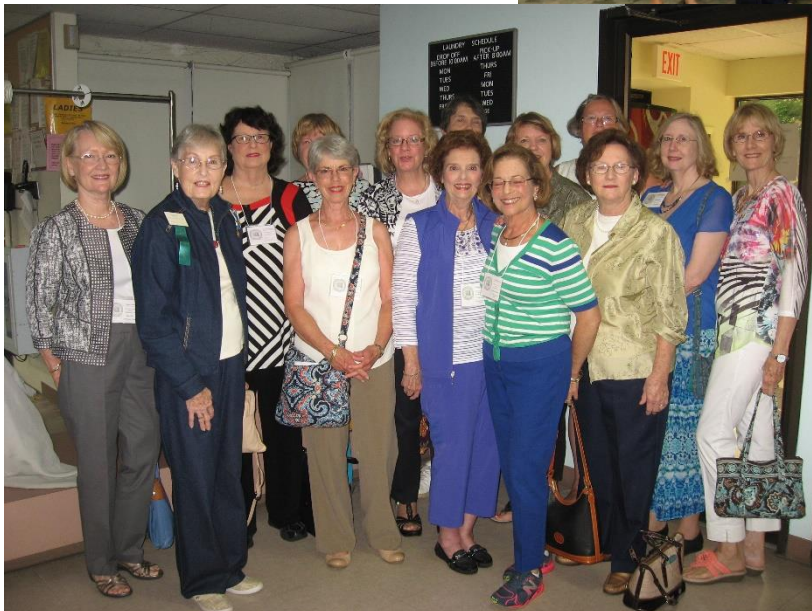
Left: The wives of the SAR attendees were treated to a special tour of the Colonial Williamsburg Costume Design Center.